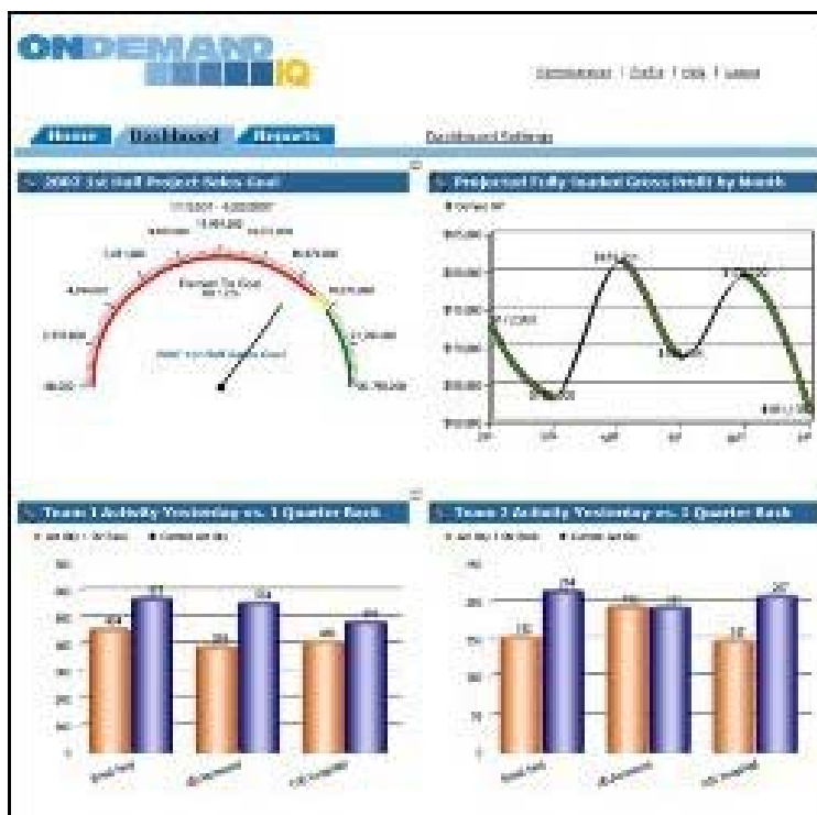
Figure 1: OnDemandIQ Insights dashboard offers relevant, actionable information